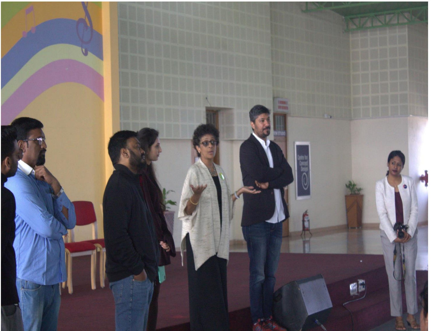
Head Department of Performing Arts Christ University Bangalore - 560 029